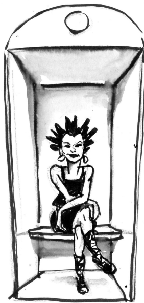
Figure 2. A potential contestant in our game show sitting in her booth, contemplating what to do when chosen as an actual contestant (drawing by Laurent Taudin).

A = I , a candidate, have been selected as a contestant, aware of the protocol for selecting candidates to become contestants.