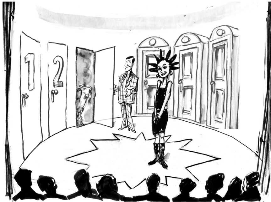
Figure 3. Monty Hall opens one of the doors with a goat behind it for one of the contestants in an episode of “Let’s Make a Deal” with a twist inspired by the Sleeping Beauty Problem (Drawing by Laurent Taudin).

The likelihoods are (cf. Equation (5) and the reasoning leading up to it):