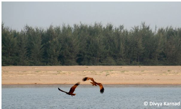
Image 1. Habitat in which the Striped Hyena was spotted at the edge of the Casuarina plantation on the beach at Rushikulya River mouth, Odisha, India.

occurrence of the Striped Hyena in the vicinity of the Rushikulya mass nesting beach. It adds to previous research on sea turtle predation by providing the first record of a direct sighting of the Striped Hyena feeding on Olive Ridley Sea Turtle eggs on the Rushikulya mass nesting beach in Odisha.