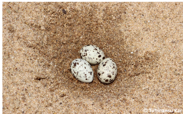
Image 4. Indian Skimmer nest with eggs on an island in the river Mahanadi near Mundali, Cuttack, Odisha