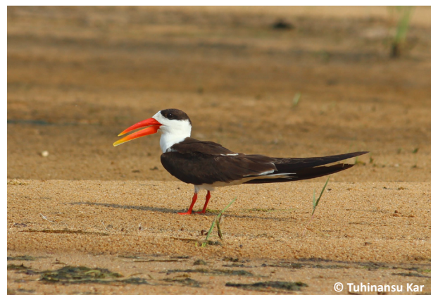
Image 1. An Indian Skimmer on an island in Mahanadi River near Mundali, Cuttack, Odisha