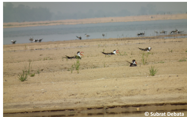
Image 5. Indian Skimmers incubating their eggs on an island in the river Mahanadi near Mundali, Cuttack, Odisha

during the breeding season along the entire length of the River Mahanadi and other large rivers is essential to understand the status of the Indian Skimmer in Odisha. The results of these will be helpful in reassessing the global status of the species and formulating conservation plans for the future.