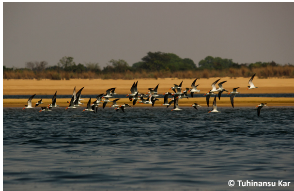
Image 2. A flock of Indian Skimmers flying over the river Mahanadi near Mundali, Cuttack, Odisha