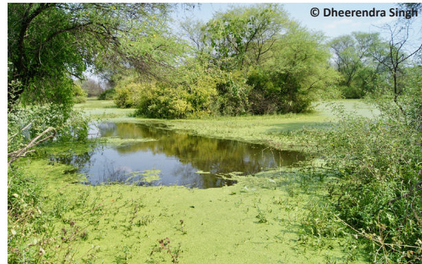
Image 1. Free floating plant communities of Lemna, Spirodela and Wolffia.