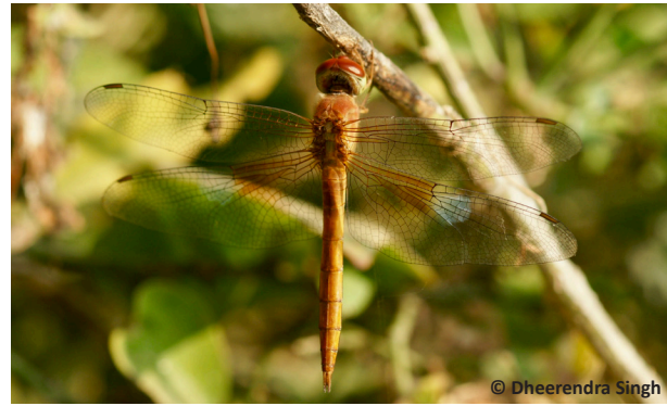
Image 9. Tholymis tillarga , female