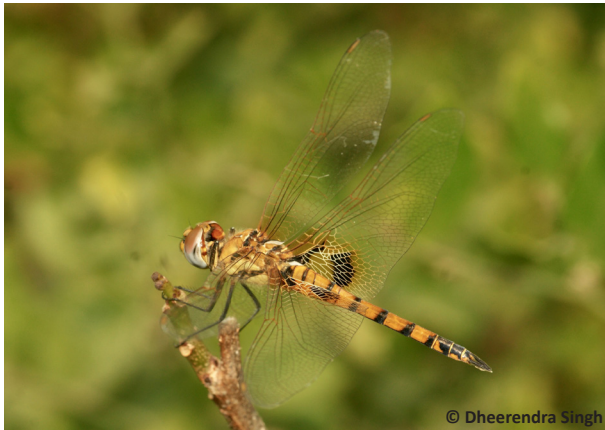
Image 10. Tramea basilaris burmeisteri , female

seen near Keoladeo Temple every year and in the bushes along the main road.