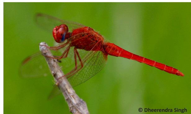
Image 7. Crocothemis servilia , male

Observed individuals: Together with Brachthemis contaminata the most common and abundant dragonfly