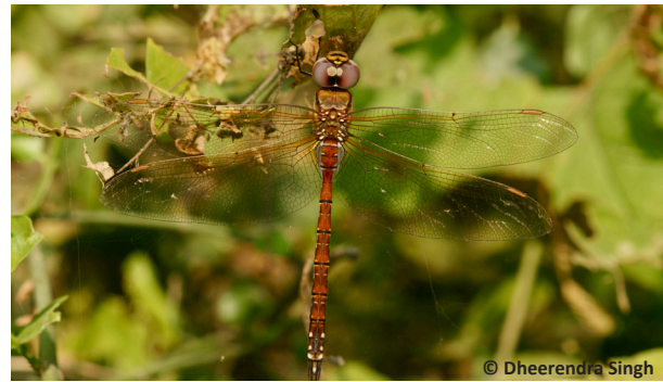
Image 6. Anaciaeschna jaspidea , fresh emerged male

Observed individuals: A common Libellulid, mostly observed near the boating place and Mansarovar. This dragonfly with its peculiar abdomen prefers (like many damselflies) the grassy habitats, where they hide and sit. Therefore, it is sometimes difficult to find.