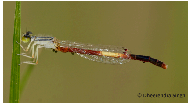
Image 4. Ischnura nursei , male