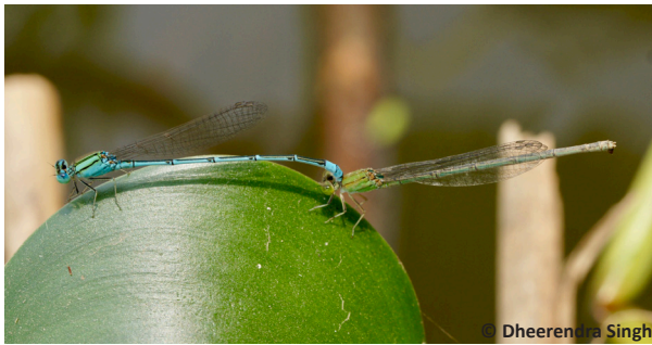
Image 5. Pseudagrion decorum , tandem