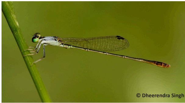
Image 3. Agriocnemis pygmaea , male