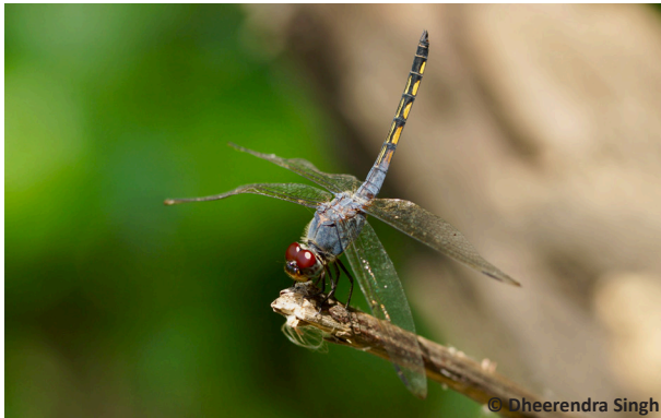
Image 8. Potamarcha congener , male