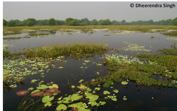
Image 2. Rooted plant communities with floating leaves or branches like Nymphaoides and Neptunia.

floating plant communities are represented by species like Spirodela polyrhiza , Lemna perpusilla , Azolla pinnata and Eichhornia crassipes (Images 1 & 2). The invasive E. crassipes is removed from time to time; it often forms large dominating patches, which displaces the native aquatic vegetation. These free-floating plant species usually occur in open water areas and keep drifting along with the wind. Confined to the deepest areas with open water and a loose muddy bottom is the Hydrilla-Najas vegetation. The main species forming this association are Hydrilla verticillata , Najas minor , Potamogeton nodosus , Nymphaoides indicum , N. cristatum and Nymphaea pubescens . This type of vegetation is very important for several odonates, because this variety of submerged plants gives excellent breeding habitat for odonates, which lay their eggs into the plant tissue (endophytic oviposition).