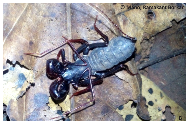
Image 2. A - male & B - female Labochirus tauricornis (Pocock, 1899) in the forest litter of southern Goa, India