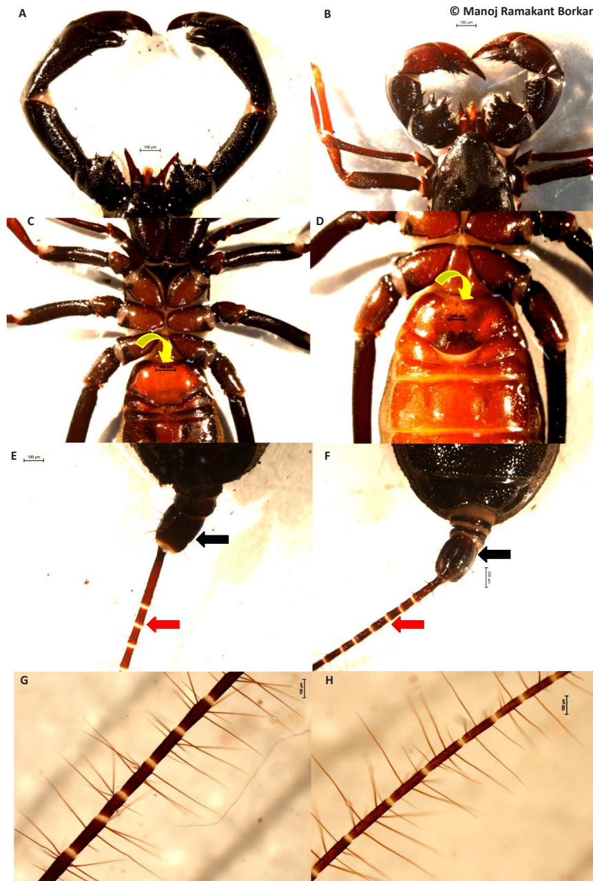
Image. 3. Stereomicrographs of various body parts of male and female Labochirus tauricornis Pocock collected from the locality of Tamdi, Goa

Note the longer and slender pedipalps of the male (Image 3A) as compared to the stout and shorter ones of the female L. tauricornis (Image 3B). The genital sternum (curved yellow arrow) is bulged in male and presents a hexagonal profile (Image 3C), whereas that of the female tapers posteriorly (Image 3D). Greater apposition manoeuvrability is apparent in the pedipalps of the male. Note the flagellum (red arrow) arising from the pygidium (black arrow) in both the sexes (Images 3E & 3F). In both the sexes, the flagellar articles show presence of stiff spine whorls at the articulating joints (Images 3G & 3H).