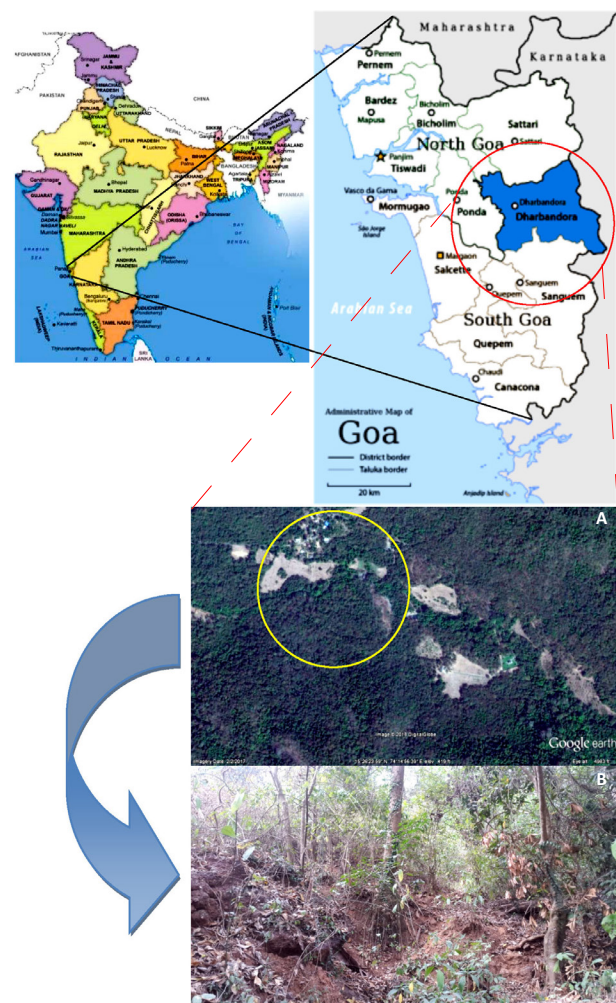
Image 1. The location of the habitat of Labochirus tauricornis , Pocock; locality Tamdi Village of Dharbandora Taluka in Goa, India. (A- Google image of the landscape; B- Riparian microhabitat at Tamdi Village.)

Gross and micro-morphological studies and measurements necessitated killing the specimen by freezing and preservation in 70% ethanol for further