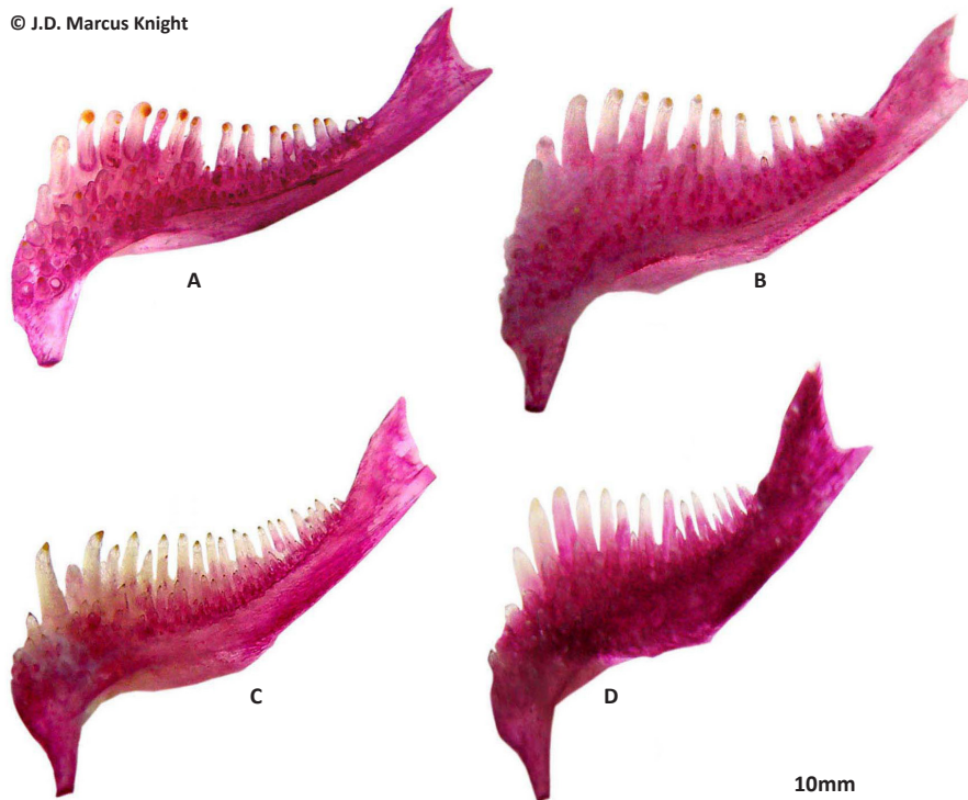
Image 3. Fifth ceratobranchial of Channa species: A - C. pardalis ; B - C. stewartii ; C - C. melanostigma ; D - C. gachua .