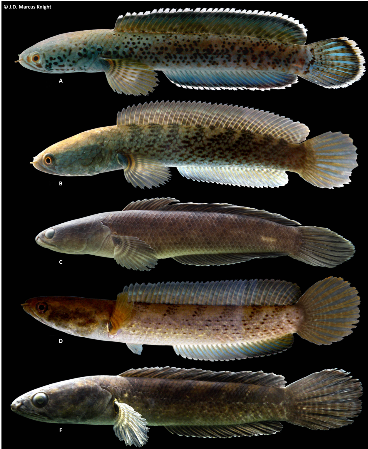
Image 2. Channa pardalis : A, paratype, ZSI/SRC F 8954, 139.3mm SL, showing live colouration, West Khasi Hills, Meghalaya. C. stewartii : MKC 100, Cachar, Assam, B, 109.2mm SL, showing live colouration, C, 128.6mm SL, showing colouration in preservative. C. melanostigma : MKC 012, Tinsukia, Assam, D, 118.1mm SL showing live colouration, E, 122.9mm SL, showing colouration in preservative.