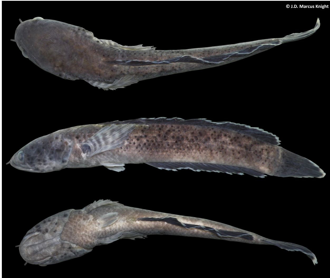
Image 1. Channa pardalis holotype, BNHS, FWF 181, 127.5mm SL.

and single inner row of large uniform sized teeth. Vomer with six small sharp, pointed teeth and four canine-like teeth. Two rows of teeth on the palatine, outer row with numerous minute teeth and inner row with short, stout inward curved teeth. Fifth ceratobranchial slender, with numerous long sharp inward pointing teeth (Image 3A).