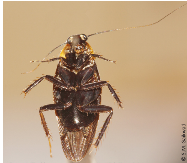
Image 2. Hemithyrsochera palliata (Fabricius, 1798) - ventral view