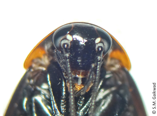
Image 4. Hemithyrsochera palliata - head ventral view