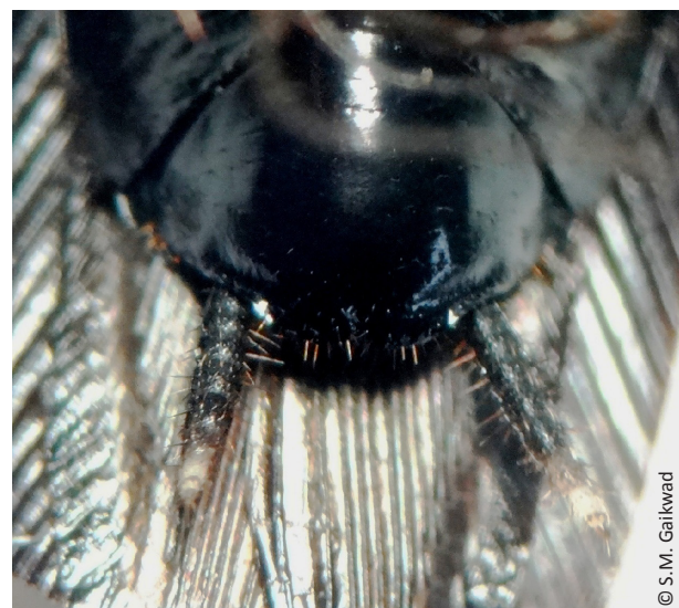
Image 5. Hemithyrsochera palliata - abdomen showing subgenital plate and cerci.

Diagnosis: Female: The body color is shining dark brown (Image 1). The body length is from 12.04–12.07 mm; pronotum length is from 2.81–2.9 mm; pronotum width is from 3.4–3.6 mm; and tegmina length is from 8.98–9 mm. The head is not very broad, vertex slightly exposed, ocellar spot prominent forming an angle with intervening area, clypeus and labrum large (Image 4); pronotum subelliptical black with golden yellow margin rounded about the pronotum, slightly convex, outer lateral margin rounded and posterior margin obtusely rounded (Image 3); legs long and slender; coxae large and rather closely approximated; antero-ventral margin of the front femur with row of spines which generally decrease in size laterally; tibia more spiny than femur, spines increasing in size antero-posteriorly; tarsi five segmented (Images 2, 6); tegmina and wings fully developed, subcosta nearly reaching the median point, radial vein branched, forked before the middle and sending 11 to 12 branches to the apical angle; the entire