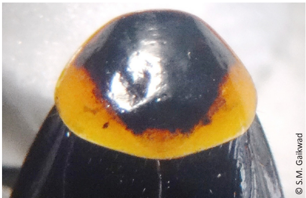
Image 3. Hemithyrsochera palliata - pronotum dorsal view