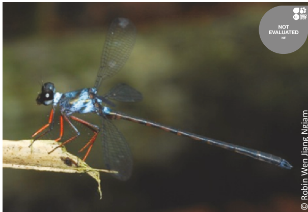
Image 4. Podolestes chrysopus (male). This is a peat swamp specialist and is found at only two other unprotected sites in Sarawak.