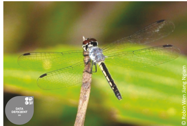
Image 8. Brachygonia ophelia (female). This is the first record of the species in Sarawak since 1910.

species having been collected in Sarawak since that in Laidlaw (1914) of two males collected from “Kuching” in May 1896. The species is known from Borneo, Sumatra, Belitung and peninsular Malaysia, but is seldom recorded. 2 males, 6.vii.2012, RD.