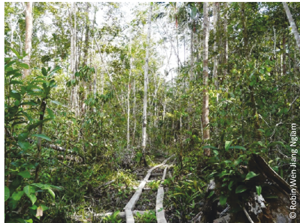
Image 3. A forest trail in Ulu Maludam.