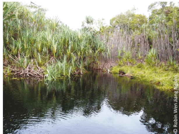
Image 1. Sungai Maludam.

Specimens were preserved either by treatment with acetone or immersion in ethanol. The specimens are currently held in either the Naturalis Biodiversity Centre in Leiden, the Raffles Museum of Biodiversity Research at National University of Singapore, or the working collections of the first two authors.