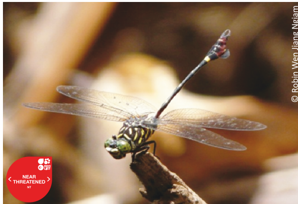
Image 7. Ictinogomphus acutus (male). It was very abundant along Sungai Maludam.