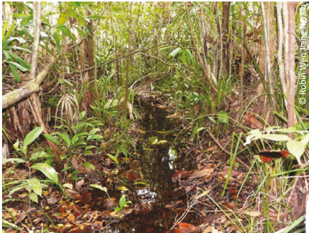
Image 2. Small tributary stream of Sungai Maludam.