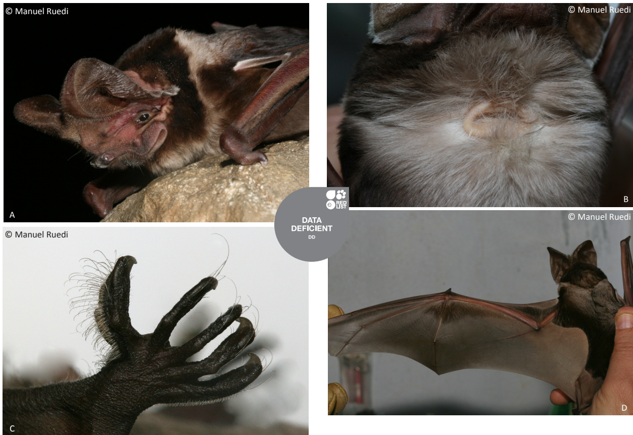
Image 1. Portrait of an adult male Otomops wroughtoni captured in the Jaintia Hills (A), and details of its chest gland (B), pilosity of hindfoot (C) and shape of the wing (D).

Thysanachaena maxima , interspersed with isolated patches of semi-evergreen forest.