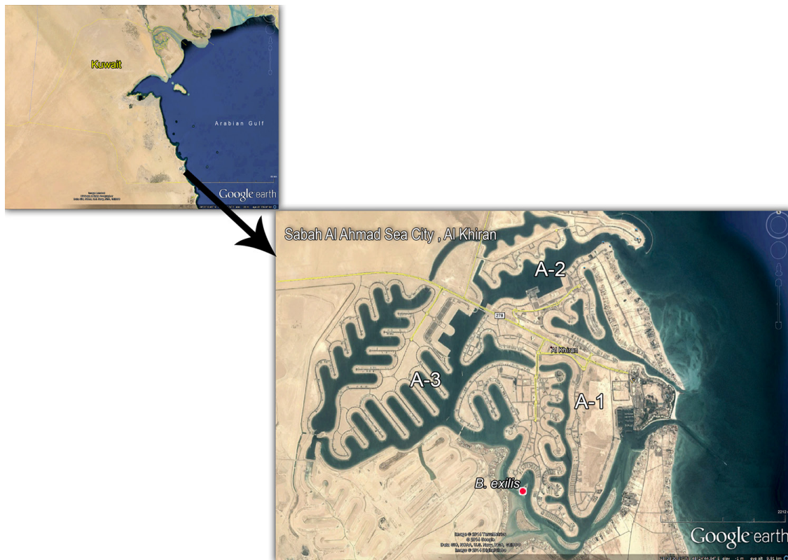
Image 1. Location of Brephidium exilis record from Sabah Al Ahmad Sea City, Kuwait

is suspected to be introduced into the Arabian Gulf by US expatriates working in UAE, who possibly carried succulents with eggs deposited onto the leaves or from use of North American halophytes for land reclamation, fodder and landscaping (Pittaway et al. 2006). The pan-tropical succulent, Sesuvium portulacastrum has been extensively used throughout the Arabian peninsula in landscaping and land reclamation projects since its first introduction to Abu Dhabi in 1989 (Böer 2002). Ubiquitous presence of S. portulacastrum in the region, the occurrence of host plants such as Atriplex spp. (Salt Bushes), and similar arid climatic conditions comparable to its native distribution range in North America are the main reasons for the successful establishment of this butterfly in this region (Pittaway et al. 2006).