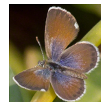
Brephidium exilis Western Pygmy Blue

DOI: http://dx.doi.org/10.11609/JoTT.o4055.6723-5 | ZooBank: urn:lsid:zoobank.org:pub:9DE78A3A-B5EC-4E73-912F-594BA3957597