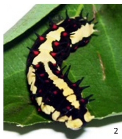
Images 1–2. 1 - Larval host plant Litsea coriacea Hook.f.; 2 - Larva of Chilasa clytia

D'Abrera, 1982, Butterflies of the Oriental Region , Part 1: 92.