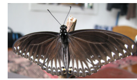
Chilasa clytia Common Mime

DOI: http://dx.doi.org/10.11609/JoTT.o3808.6719-22 | ZooBank: urn:lsid:zoobank.org:pub:0C9FF9EC-F486-415F-9DB9-A6E52595863B