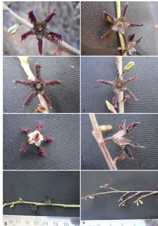
Image 3. Variation in Caralluma adscendens (Roxb.) Haw. var. attenuata (Wight) Grav. & Mayur.

A–D - flower colour variation; E–F - variation in ornamentation in lower side of corolla lobes; G–H - variation in branching pattern of inflorescence.