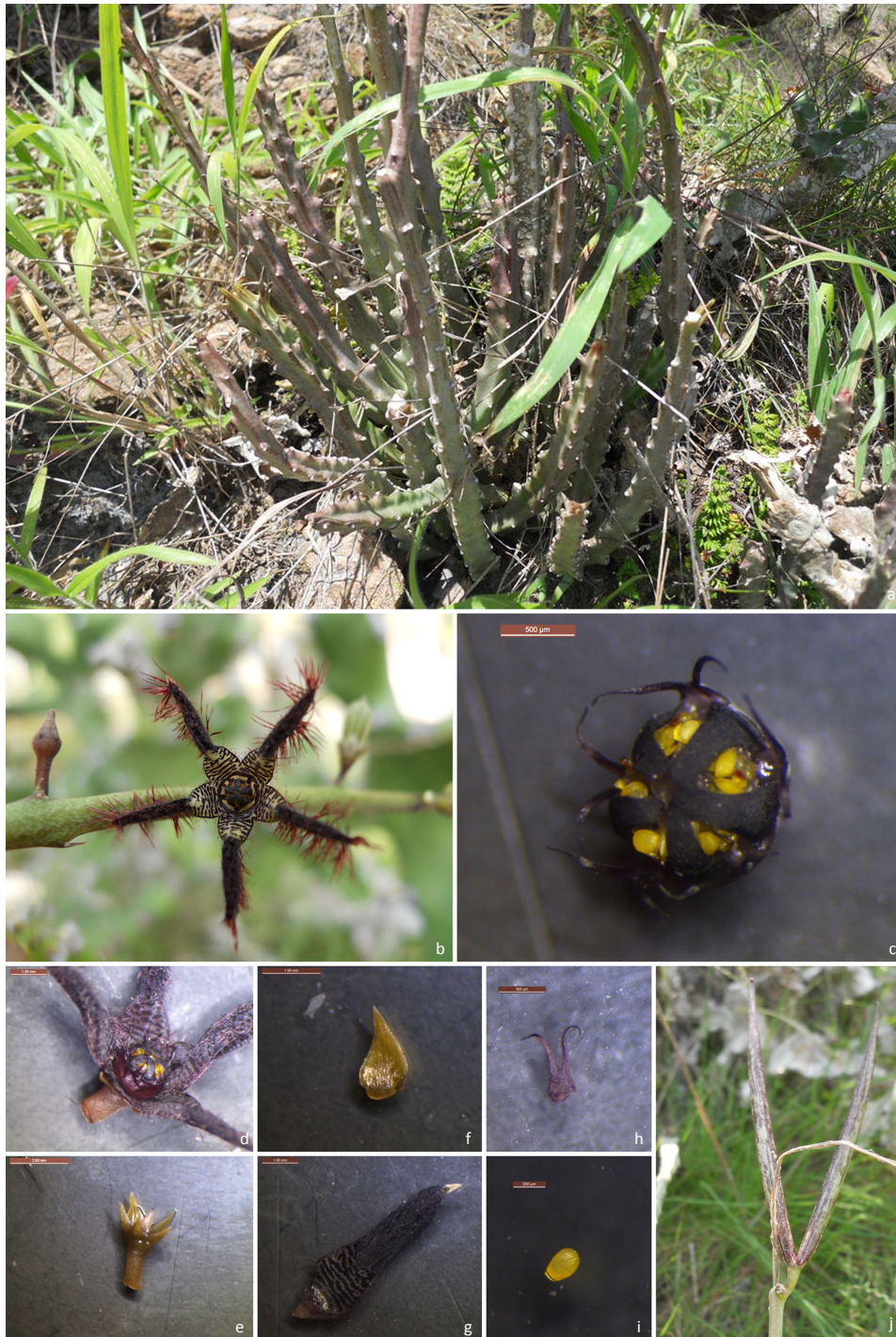
Image 1. Caralluma adscendens (Roxb.) Haw. var. attenuata (Wight) Grav. & Mayur. A - habit; B - close up of flower; C - corona-surface view; D - corona-side view; E - calyx; F - calyx lobe; G - corolla lobe; H - outer corona; I - pollinium; J - follicle.

depends on the substratum and also its associates for their usual growth (Images 2 A–D). Mostly they grow on open rocky or soil substratum but in many places they are associated with thorny bushes like Prosopis juliflora (Sw.) DC., Catunaregam spinosa (Thunb.)