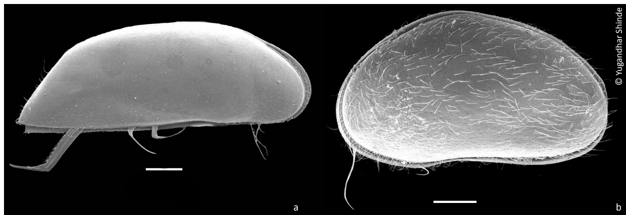
Image 2. SEM of ostracod species (a) Chrissia cf. krishnakantai (Deb, 1972) from Ajinkyatara Fort; (scale - 500µm); (b) Plesiocypridopsis dispar (Hartmann, 1965) from Visapur (scale - 100µm)

The number of species currently known from the northern Western Ghats is likely to be an underestimation. An intensive sampling effort, probably as a part of a larger program for studying freshwater biodiversity is likely to bring more taxa to light. Our study on ostracods indicates that the freshwater habitats on the rocky plateaus of the northern Western Ghats are unique, holding a treasure of diversity, yet to be discovered. Most of these habitats are temporary, characterized by seasonal drying and filling cycles in a regular frequency and their residents are adapted to these environmental conditions with some of them even requiring the drought as a prerequisite for subsequent resurgence (Williams 2006). Even the ephemeral habitats of unpredictable reoccurrence formed during the monsoons are microcosms of interest to investigate phenomena such as dispersal and colonization of micro- and macroinvertebrates. All these habitats are under severe threat from anthropogenic activities and their conservation requires attention.