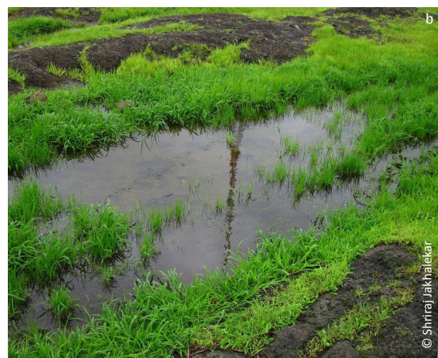
Image 1. (a) Pool from Visapur Fort, (b) Pool from Tableland (Panchgani)