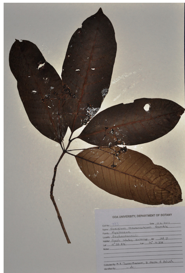
Image 2. Herbarium of Syzygium travancoricum