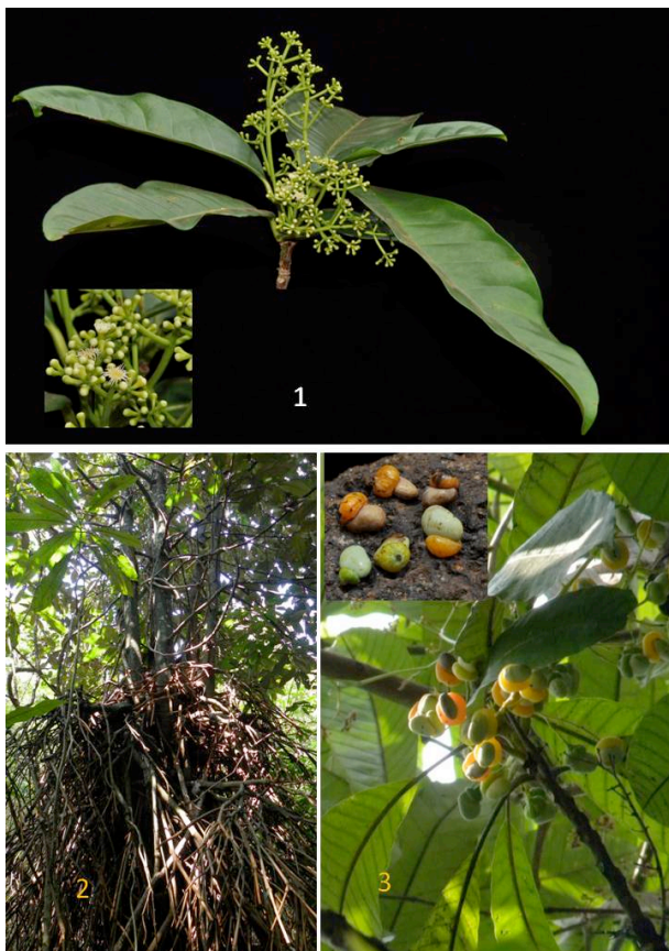
Image 1. (1) Syzygium travancoricum - Flowering twig (inset: close-up of flower); (2) Myristica fatua var. magnifica - Stilt roots; (3) Semecarpus kathalekanensis - Fruiting twig (inset: close-up of fruits).