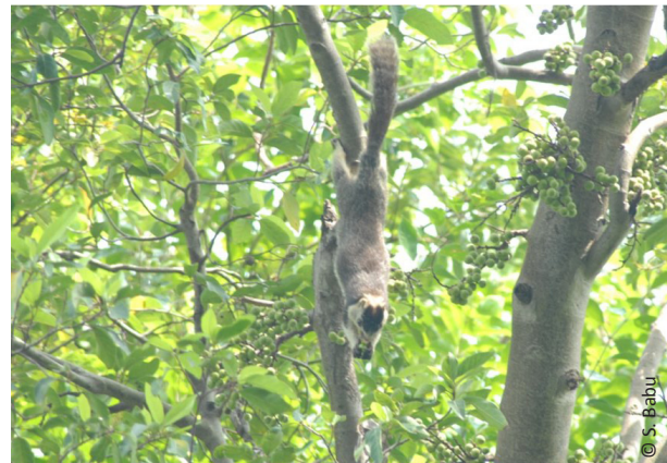
Image 1. Grizzled Giant Squirrel Ratufa macroura actively foraging on fruits of Ficus racemosa in Sathanur Dam of Thiruvannamalai Forest Division, Tamil Nadu

Here we present a new site and the eastern-most known distribution for the species from Thiruvannamalai Forest Division, Tamil Nadu. On a bird-watching trip to