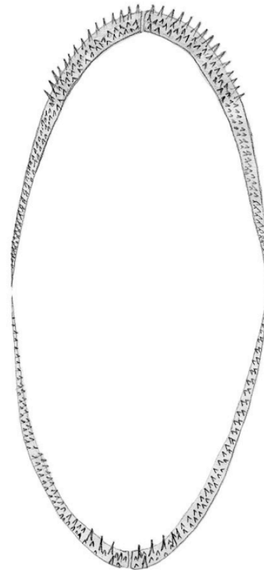
Figure 2. Dentition of Parambassis waikhomi , 36.3 mm SL (RCMMF-19)

Coloration: In 10% formalin: head and body background creamish. A faint blackish axial streak on body, darker posteriorly. Each scale margins outlined by indistinct melanophores. A vertically elongated humeral blotch, more or less continuing a vertically elongated triangular blotch immediately in