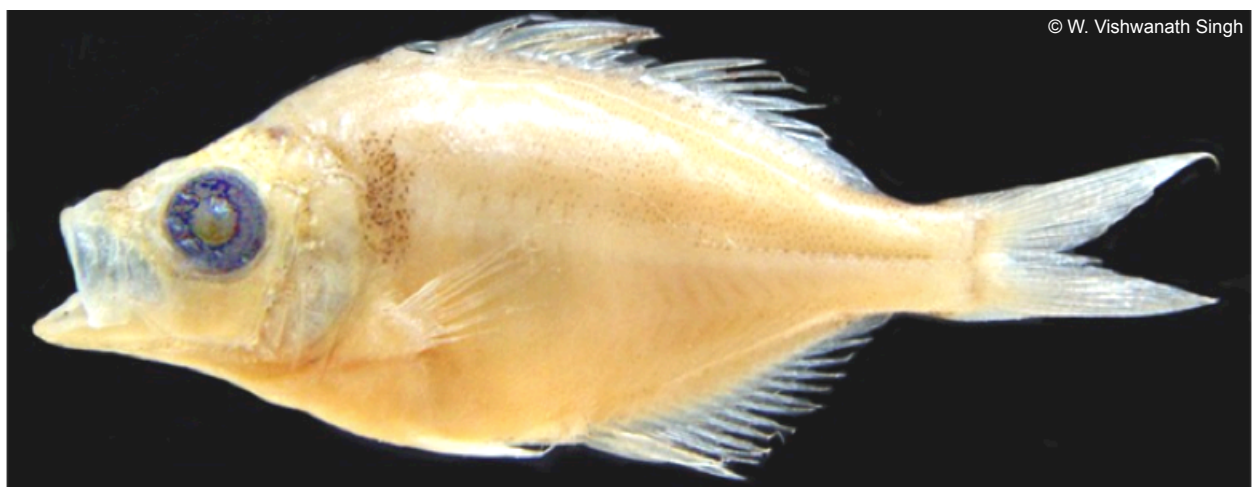
Image 1. Left lateral view of Parambassis waikhomi (RCMMF-16), 31.5mm SL