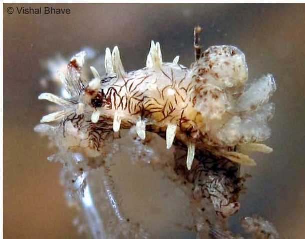
Image 1. On prey Zoobotryon verticillatum