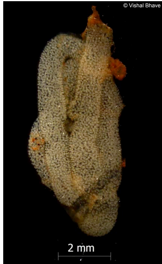
Image 6. Egg case