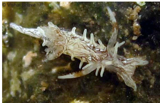
Image 3. Dorsal side