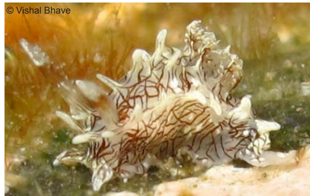
Image 2. Lateral side