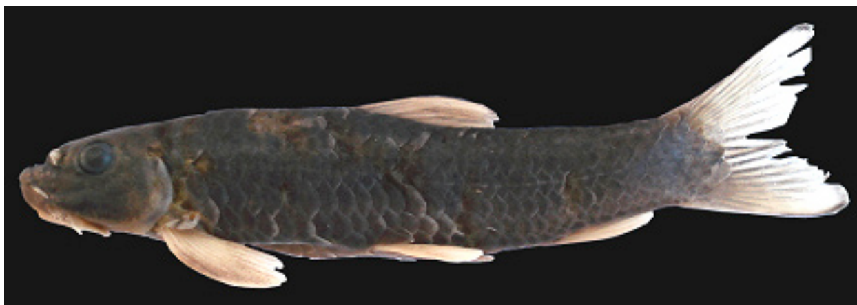
Image 1. Garra kalpangi sp. nov., holotype, RGUMF-0006, 60mm SL.; Lateral view

Measurements and counts taken from 10 specimens, 50.0–72.4 mm SL are given in Table 1. General body