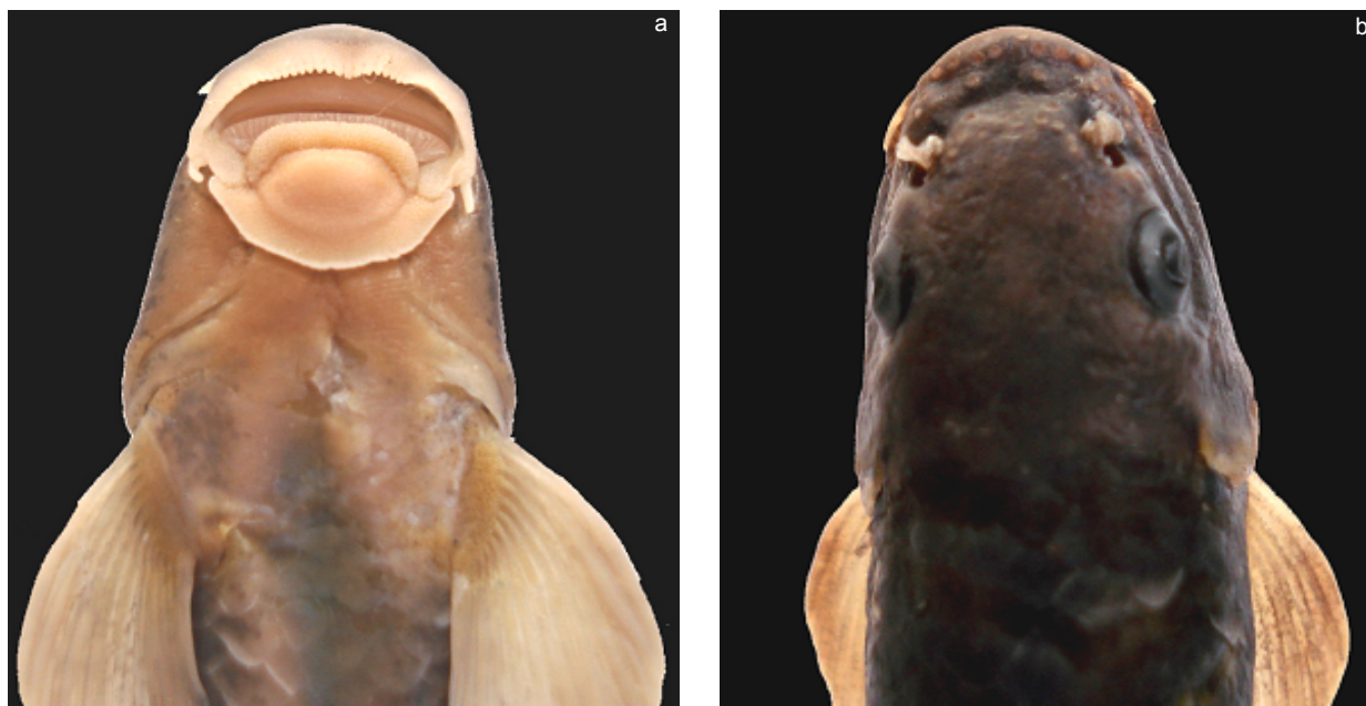
Image 2. Garra kalpangi sp. nov., holotype. a - ventral view of disc; b - dorsal view of head.

appearance in Image 1 and morphology of the mental adhesive disc and head dorsum are shown in Images 2a–b respectively.