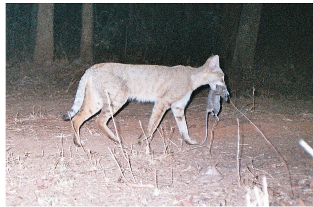
Image 1. Jungle Cat carrying a rodent in Pench Tiger Reserve, Madhya Pradesh.

and killing them in the study area. Though there was no livestock grazing in the study area, the observed occurrence of livestock remains in Golden Jackal scats during the study period were possibly due to scavenging in surrounding villages. Remains of reptiles and rodents up to species level could not be identified in the scats of jackal and jungle cat because of time constraints. Remains of birds such as doves Streptopelia sp. and partridges ( Francolinus sp.) were identified in the scats of the jackal and the jungle cat. Seeds of Dyosphyros melanoxylon and Zyzyphus mauritiana were identified in jackal scats. Similar findings were also reported from other areas (Sankar 1988; Balasubramanian & Bole 1993; Mukherjee et al. 2004). Although a high degree of overlap was observed between these two sympatric species, there was an overall difference in dietary composition as smaller body sized rodents and birds were found more in the diet of the Jungle Cat (71%) than in that of the Golden Jackal