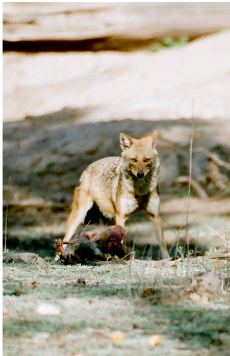
Image 2. Golden Jackal feeding on Hanuman Langur in Pench Tiger Reserve, Madhya Pradesh.

(48%), utilization of fruits by the jackal and variation in temporal activity patterns enabled them to coexist in Pench. A long term ecological study is the need of the hour on these mesocarnivores covering population estimation, seasonal food habits and temporal activity patterns using comparable scientific methods