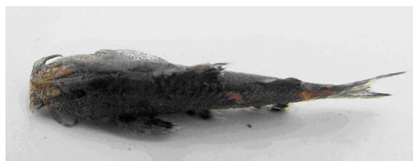
Image 2. Erethistoides montana montana Hora