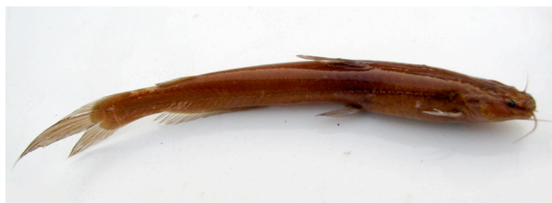
Image 3. Olyra longicaudata McClelland