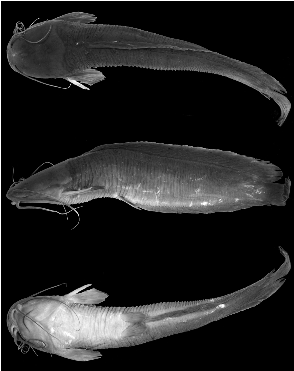
Image 1. Clarias microspilus sp. nov., MZB 8706, holotype, 136.1mm SL; Sumatra: Aceh, Sungai Lembang.

inner mandibular barbel, extending nearly to base of first pelvic-fin ray.