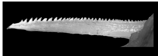
Image 2. Left pectoral spine of C. microspilus , MZB 8705, paratype, 175.7mm SL.

quarters of body; with 64* (n=1), 66 (n=3), or 68 (n=1) rays covered by thick layer of skin and without spine.