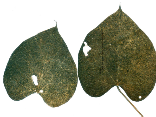
Image 1. Leaves infected with Bheemamyces argyreicola sp. nov.