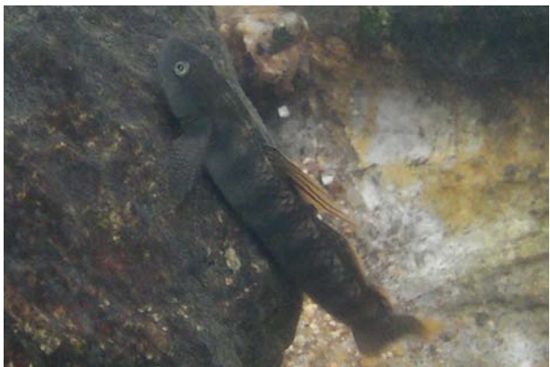
Image 9 Stiphodon multisquamus (male) showing darker colour with a slight bluish tinge.