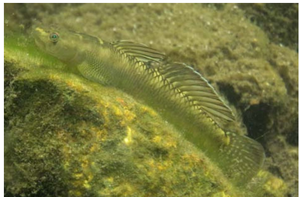
Image 10 Stiphodon multisquamus (male) showing the elongated first dorsal fin.