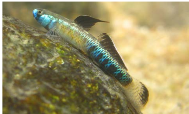
Image 16 Stiphodon percnopterygionus (male), blue colour form.

10); predorsal midline usually without scales or with very few scales (Images 11 & 12).