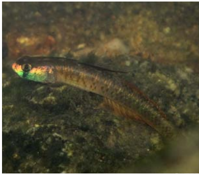
Image 17. Stiphodon percnopterygionus (male), orange colour form (Photo by W.W. Chau).