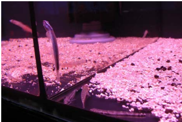
Image 1. Sicydiine gobies ( Stiphodon atropurpureus and Sicyopus zosterophorum ) in the tanks of a pet shop.