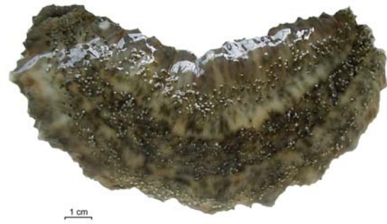
Image 4. Stichopus herrmanni - Ventral view showing three rows of pedicels