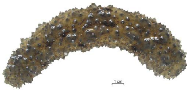
Image 3. Stichopus herrmanni - Dorsal View