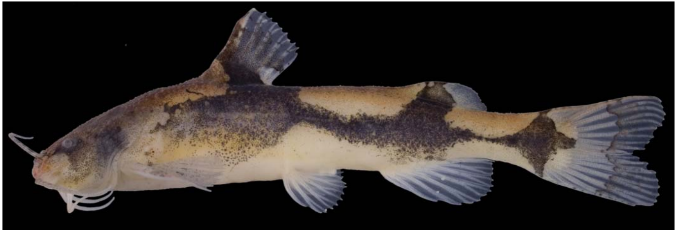
Image 5. Akysis portellus sp. nov., UMMZ 248469, paratype, 30.4mm SL, showing orange hue present on head and body of some individuals.