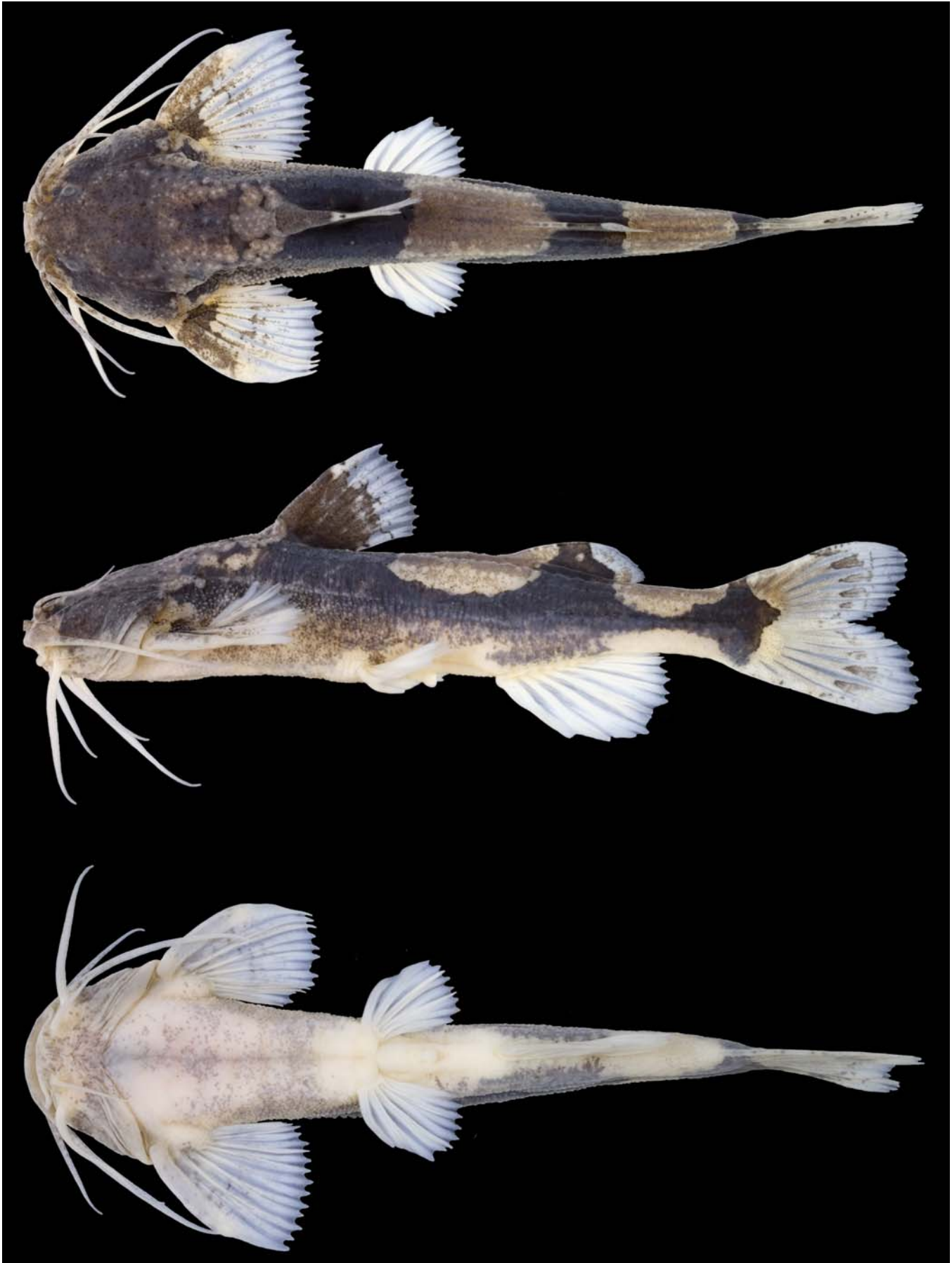
Image 1. Akysis portellus sp. nov., ZRC 51138, holotype, 32.7mm SL; dorsal, lateral and ventral views.