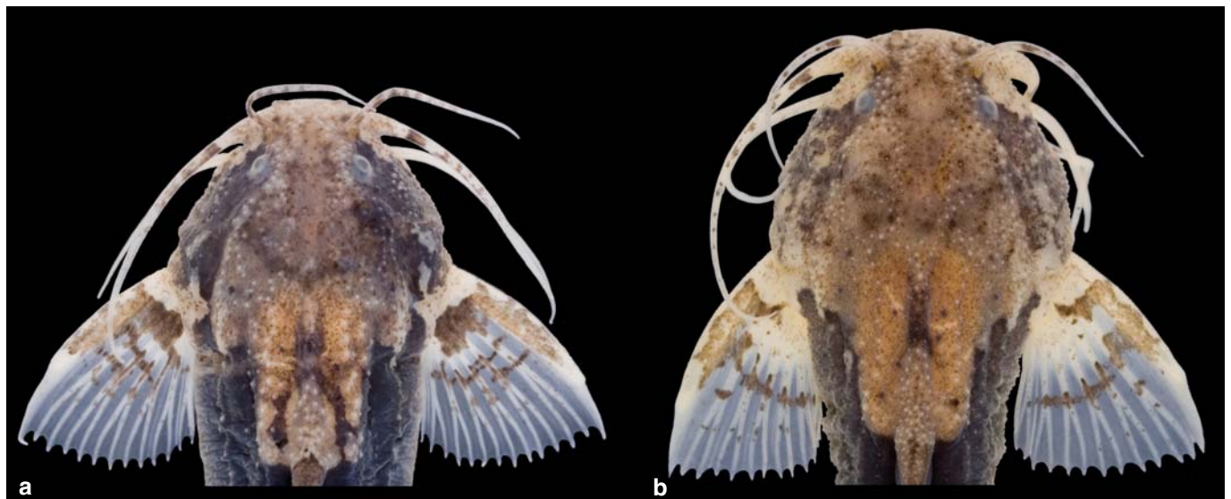
Image 3. Dorsal views of heads of: a - Akysis portellus sp. nov., ZRC 51139, paratype, 33.3mm SL; b - A. longifilis , ZRC 51157, 30.6mm SL, showing differences in shape.