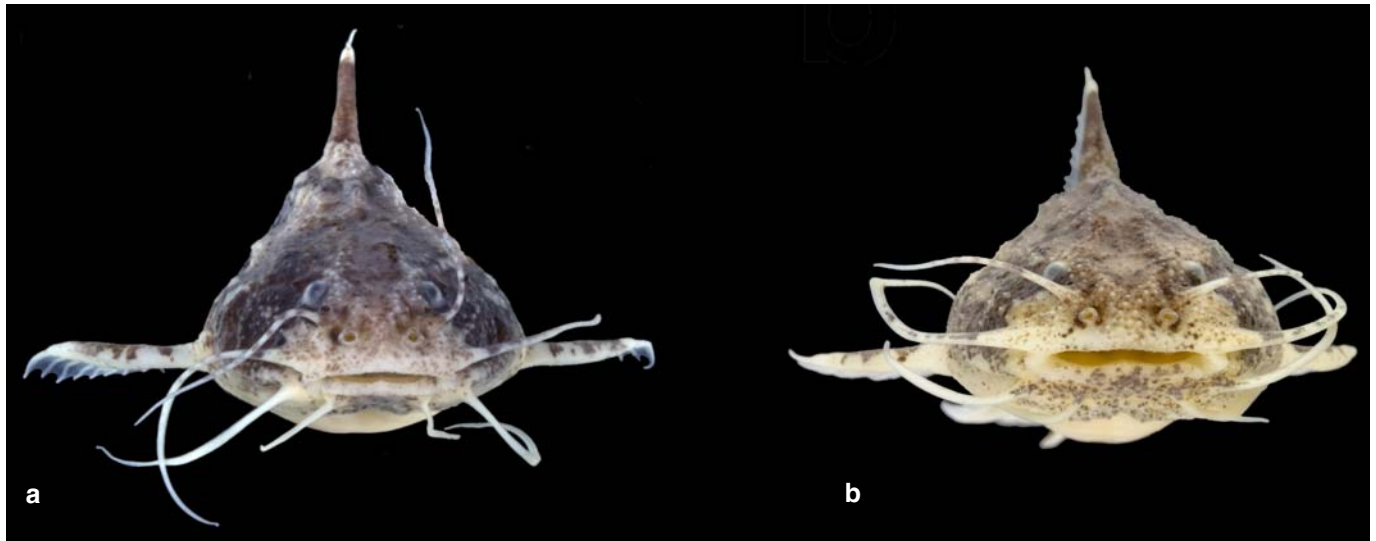
Image 2. Anterior views of: a - Akysis portellus sp. nov., ZRC 51139, paratype, 33.3mm SL; b - A. longifilis , ZRC 51157, 30.6mm SL, showing differences in gape widths.