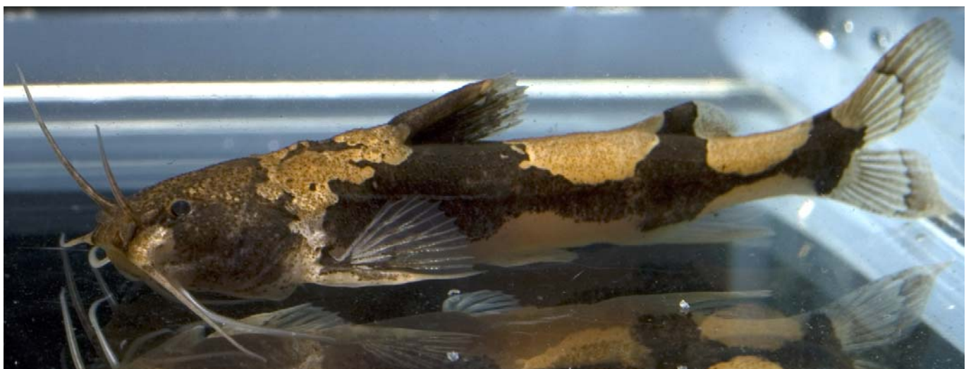
Image 4. Akysis portellus sp. nov., ca. 31mm SL (specimen not preserved), showing live coloration.