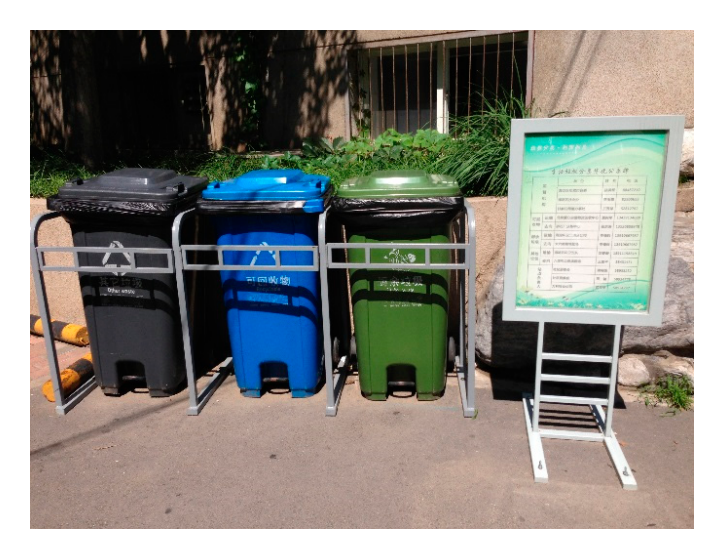
Figure 1. A set of community garbage bins: other waste, recyclable waste and kitchen waste (from left to right).

Although considerable money and effort have been invested in these pilot communities, the latest research shows source separation of household kitchen waste remains at the beginning stage. An October 2012, survey by the Beijing-based environmental organization, Friends of Nature, examined 60 pilot communities involved in the separation campaign since its introduction in 2010 [9]. It found that the program had made little progress, and only 1% of a sample of 240 kitchen waste bins contained correctly separated waste. This was the same finding as in a survey conducted by Deng et al. [10]. Residents' failure to properly separate kitchen waste forced local government to establish special teams to perform resorting.